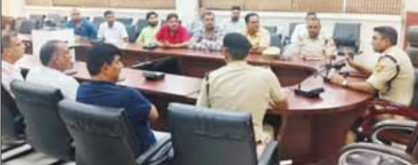
जिला सचिवालय के सभागार में होटल व गेस्ट हाउस संचालकों व पदाधिकारियों के साथ हुई बैठक