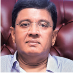
The plea of Kalanithi Maran, founder and chairman, Sun Group, was earlier dismissed by an arbitral tribunal

"This...is not a simple case of delay in removing objections in re-filing the appeals. It is a case of deliberate and wilful concealment of facts both from the Division Bench as well as from the respondents and a